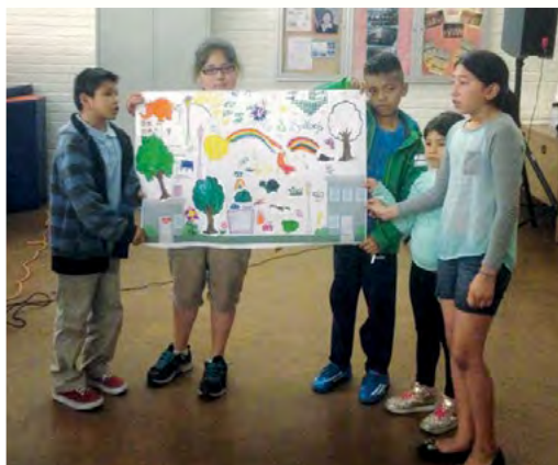
Community members of all ages provided input on ideas and priorities, as a result of the County’s many engagement activities.