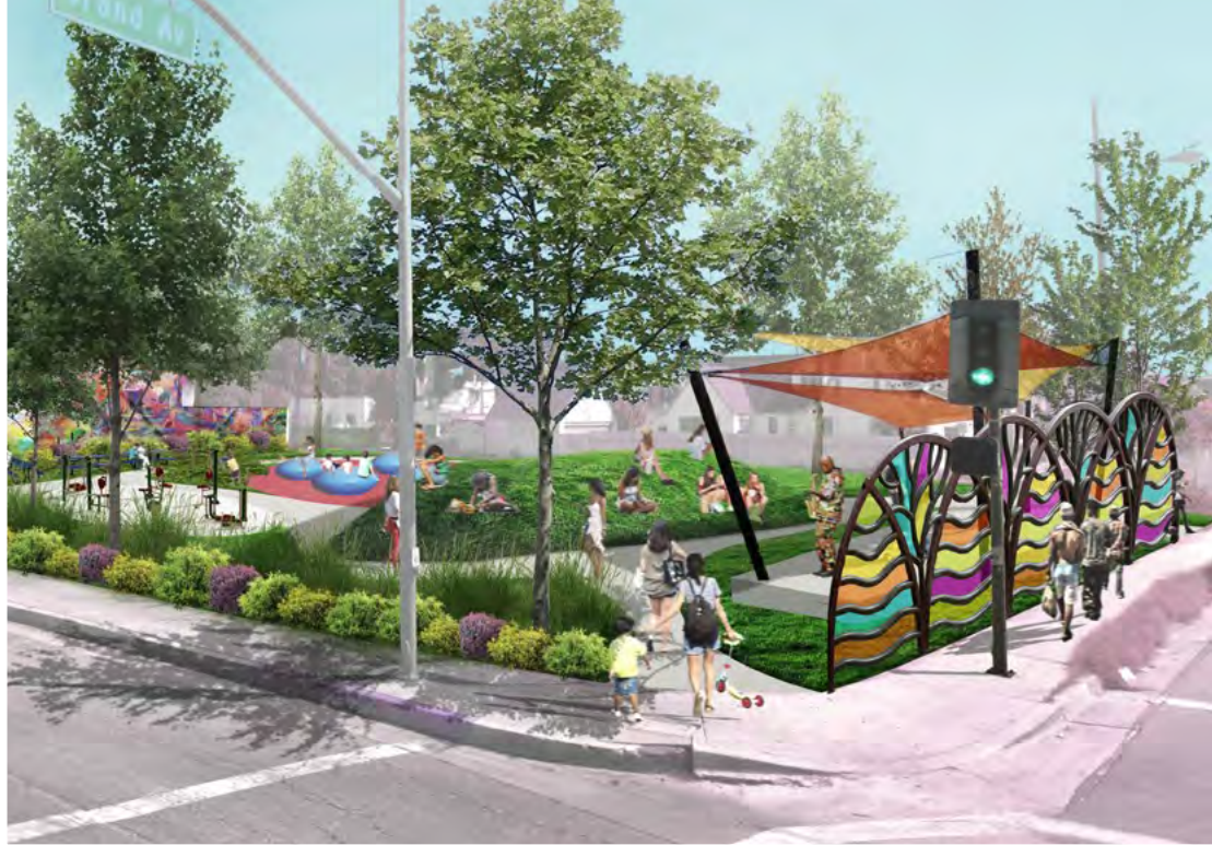
Recreation, walking, neighborhood connections, urban forestry, health, water efficiency, and community culture are integrated into the park plans, as shown in this Walnut Park illustration.

Meeting fatigue among many community members was recognized by the project team, and extra effort was paid to maintaining engagement. Tactics included partnering with other County departments on outreach activities addressing multiple projects, such as at the Willowbrook Community Fair. The project team also proactively addressed concerns about planning discussions not leading to tangible outcomes by keeping community members apprised about potential Measure A funding opportunities for implementation.