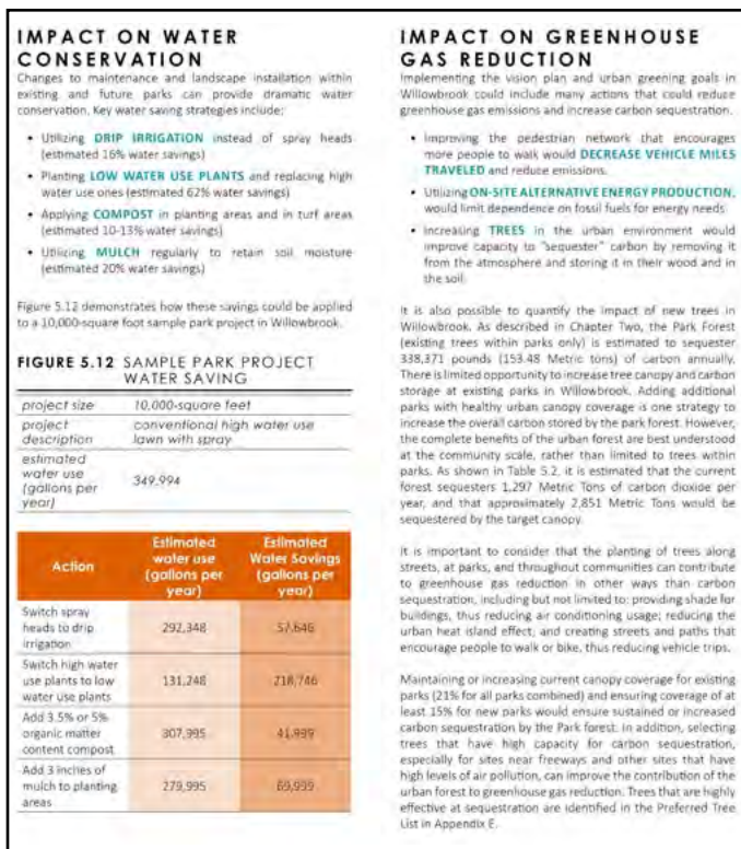
Sustainability benefits are quantified in each plan.