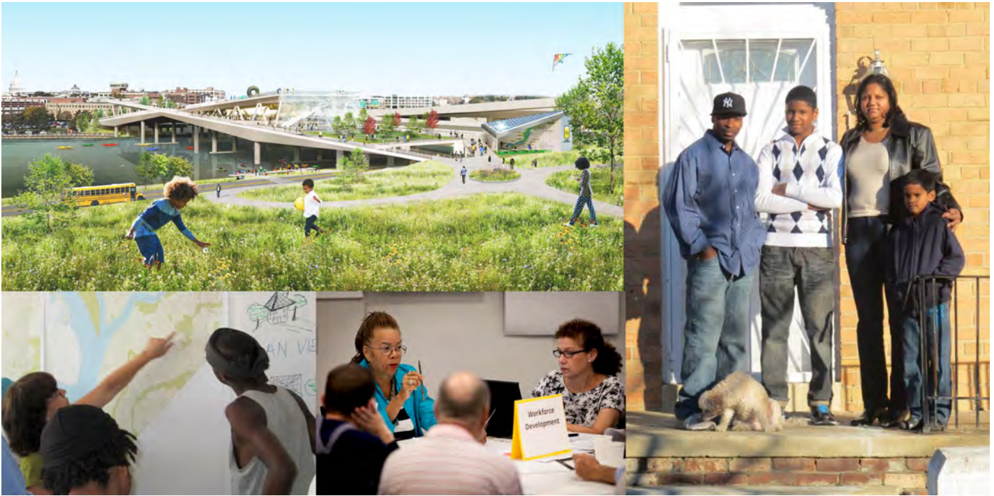
The 11th Street Bridge Park will span the Anacostia River between two very different communities in Washington, DC, and is seen by many as a model for the multidisciplinary approach and deep, long-term, community engagement necessary to ensure new parks contribute to equitable community development without gentrification and displacement.